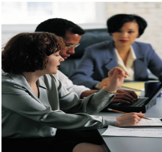
Technology consulting provides a total end to end solution